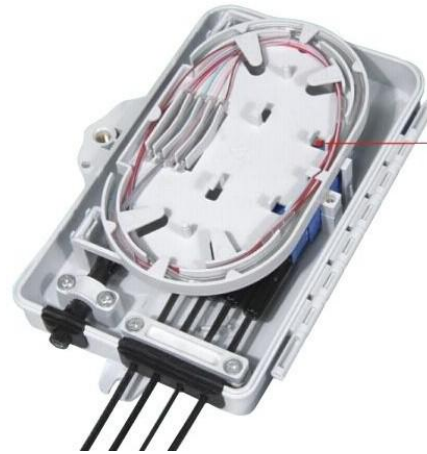
For fusion splice