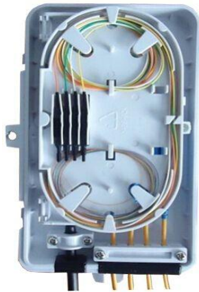
For mechanical splice